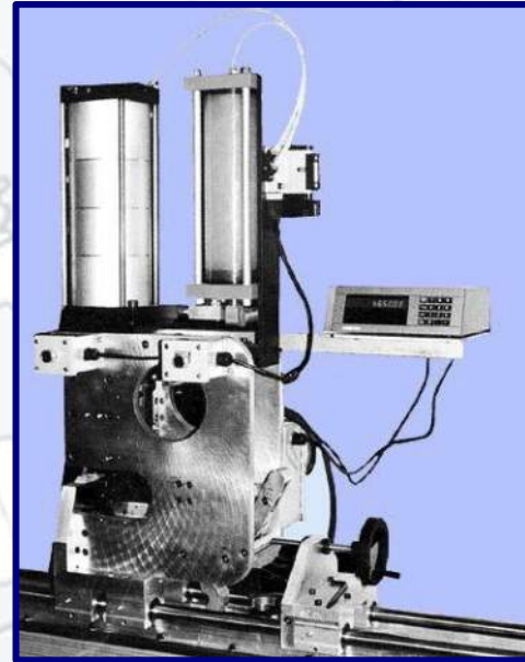
Optional Digital Readout with Handwheel for Fine Adjustment

The Oakley Center and Cut to Length Machine is designed to cut elements to an exact predetermined length. The elements are manually loaded and unloaded. The elements are automatically centered so the same amount will be cut from each end, thus ensuring that the desired pin length inside the elements will be maintained. The elements are then sheared to the desired length and automatically ejected from the machine.